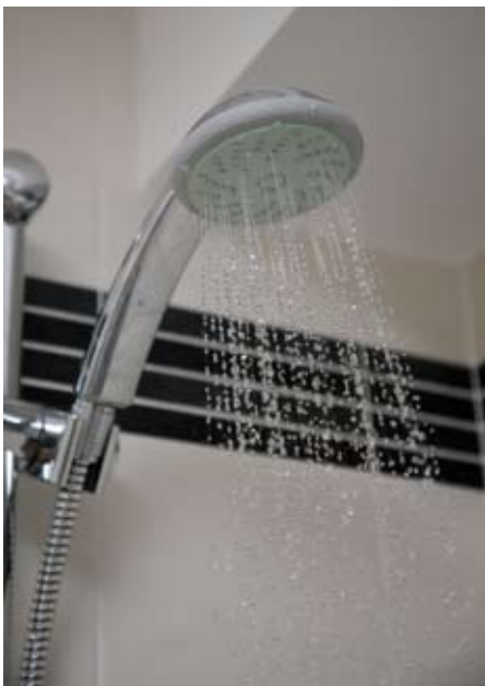
Figure 2: Flow-restricted shower

The designed and measured water use, harvesting and recycling volumes for each of the houses are compared in Table 1. The table also shows the net water use of