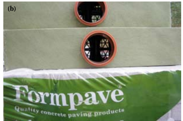
Figure 7: (a) Laying permeable paving, (b) rainwater storage tanks for installation under the paving at the Hanson Ecohouse™