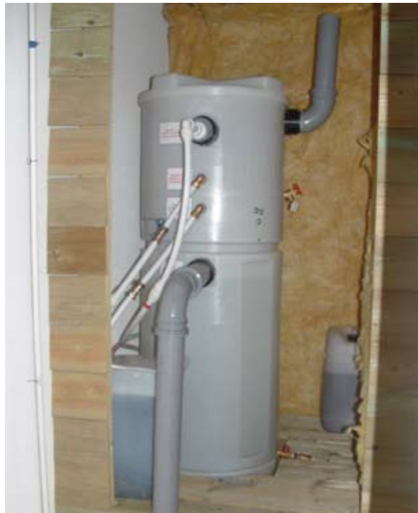
Figure 9: Brac [15] greywater harvesting system