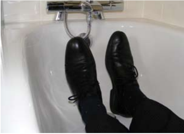
Figure 3: Betteform Low-line bath in the Ecotech Organics™ house. Photo gives an indication of the height of the overflow