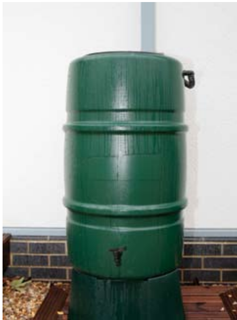
Figure 5: Water butt