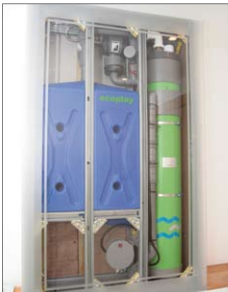
Figure 8: Internal components of a Polypipe Ecoplay [14] greywater recycling unit

The colour of water in these systems is worth noting. It often has a grey hue so end-users need to be prepared for this. In addition, it is also possible for the water to be contaminated, which is more likely if systems collect 'sullage', ie water from kitchen or utility room sinks. Examples of contamination in greywater on the BRE Innovation Park have included coffee granules, which have turned the water brown for a brief period and, more seriously, paint from the washing of brushes. This sort of contamination would be less likely if the greywater came only from baths and showers as is generally recommended.