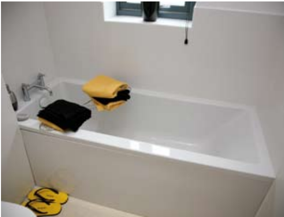
Figure 4: Bath in the Hanson Ecohouse™

The use of small-capacity washing machines and dishwashers are an effective way of enabling a low target consumption to be achieved under the Code, however, they may require the occupants of the home to increase the frequency of use of such appliances.