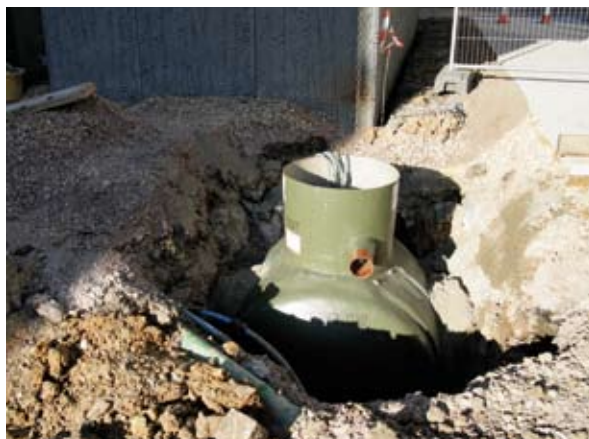
Figure 6: Envireau [11] underground water tank being installed at the Kingspan Lighthouse™

Another problem with the harvesting system has been caused by the poor installation of a drainage chain instead of a conventional downpipe. The chain results in the loss of water between the gutter and the gully and has become rusty over time which is now also contributing to the brown coloration of the water. The presence of iron may cause staining when the water is used for washing clothes.