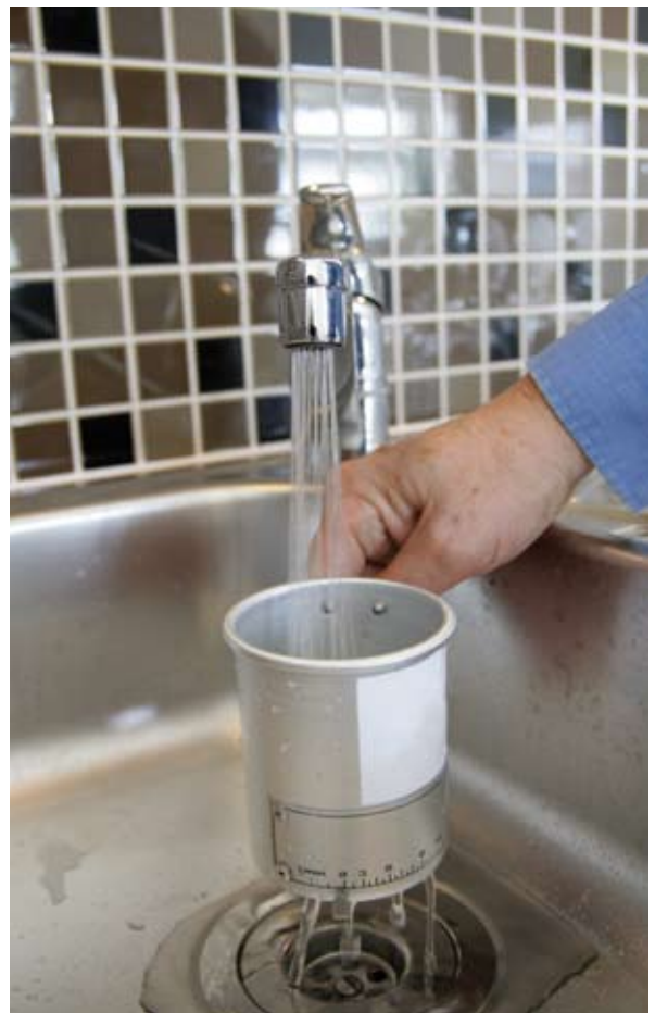
Figure 1: Measuring flow from a flow-regulated tap

In Wales, all new social housing should comply with Code Level 4 'as soon as possible' and all new dwellings must be Code Level 5 by 2011.